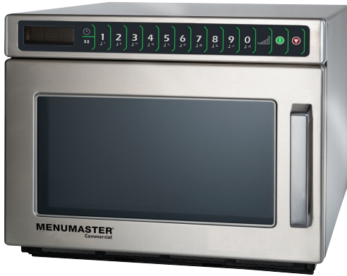
Model DEC21E2 shown