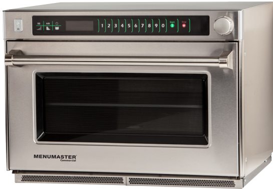
Model MSO5211 shown